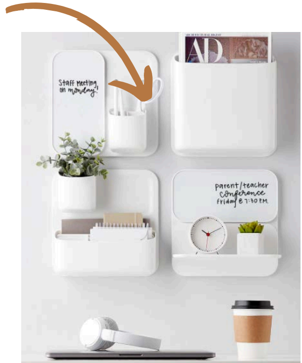
PERCH Magnetic Modular System

21. WI-FI This might be the biggest thing to research. If you are on holiday for a couple of weeks, not working, and are staying in your own country, you may get away with downloading LOTS of stuff before you leave home and rely on your phone and hot spots.