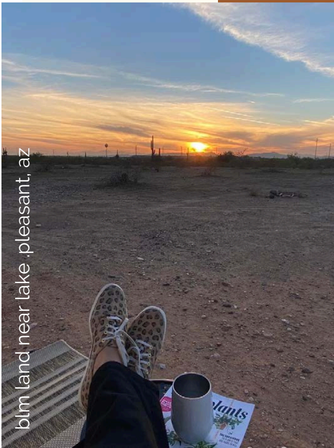
blm land near lake .pleasant, az

https://store.usgs.gov/recreational-passes