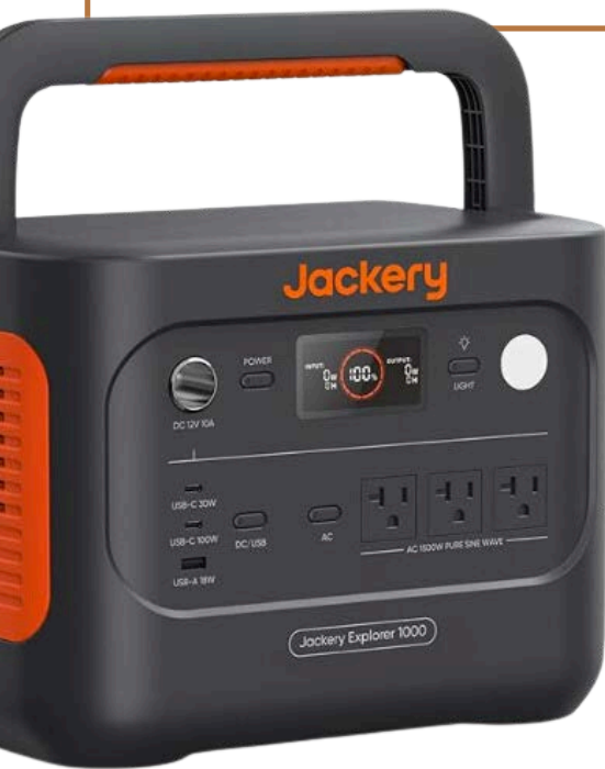
jackery 1000 v2

The only thing I can't use it for is my Nespresso or the Air Conditioner. With it, I can easily cook, power my Starlink, and work outdoors. AND yes, folks tell me it works well with their CPAP machines too.